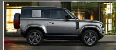
2023 Land Rover Defender

IS A PROUD SPONSOR OF THE MARCUS PERFORMING ARTS CENTER