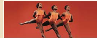
DANCE THEATRE OF HARLEM February 14, 2024 | 7:30pm

3-show packages start at just $87 - Best Value! Single shows available starting in July