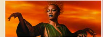
CÉCILE McLORIN SALVANT January 27, 2024 | 7:30pm