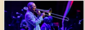
DELFEAYO MARSALIS & THE UPTOWN JAZZ ORCHESTRA February 29, 2024 | 7:30pm

MarcusCenter.org/Jazz · 414.273.7206 Groups 10+ Save! Call 414.273.7207