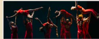
HUBBARD STREET DANCE COMPANY March 9, 2024 | 7:30pm