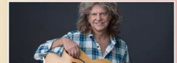
PAT METHENY October 5, 2023 | 7:30pm

3-show packages start at just $87 - Best Value! Single shows available starting in July