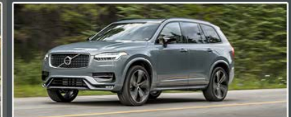
2023 Volvo XC90