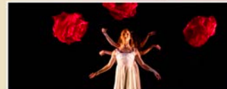
MOMIX: ALICE April 11, 2024 | 7:30pm

MarcusCenter.org/Dance · 414.273.7206 Groups 10+ Save! Call 414.273.7207